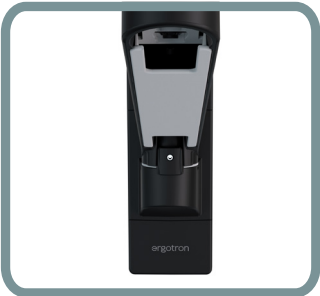
NEW ROTATION STOP: PREVENT DAMAGE TO WALLS, PARTITIONS, OR CUBICLES