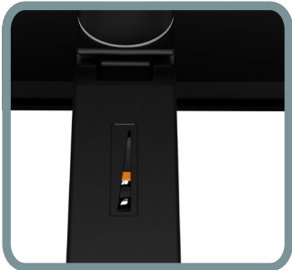
NEW TENSION INDICATOR: SET TENSION LEVEL ONCE AND REPEAT FOR QUICK INSTALLATION OF MULTIPLE WORKSTATIONS