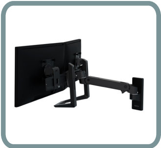
DUAL DIRECT KIT