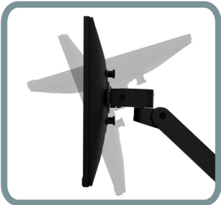
INCREASED TILT RANGE: BETTER ERGONOMICS FOR USERS