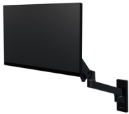
LX Pro Wall Monitor Arm