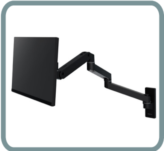
MONITOR ARM EXTENSION