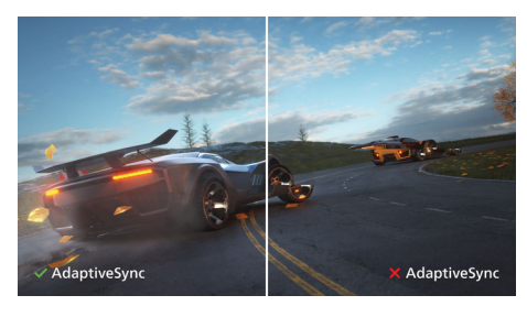
Gaming shouldn't be a choice between choppy gameplay or broken frames. Get fluid, artifactfree performance at virtually any framerate

with Adaptive-Sync technology, smooth quick refresh and ultra-fast response time.