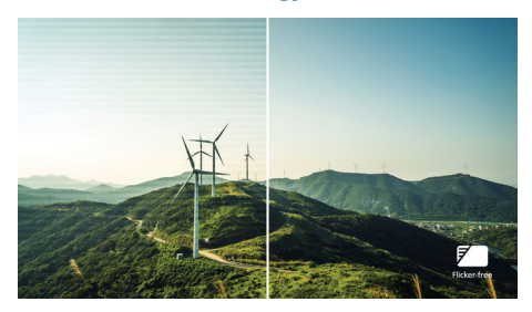
Due to the way brightness is controlled on LED-backlit screens, some users experience flicker on their screen which causes eye fatigue. Philips Flicker-free Technology applies a new solution to regulate brightness and reduce flicker for more comfortable viewing.