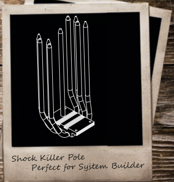
Shock Killer Pole Perfect for System Builder