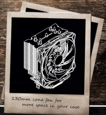
130mm cone fan for more space in your case