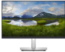
Dell 24 USB-C Hub Monitor - P2422HE

Stay productive, no matter where you work. Reduce harmful blue light with this sleek 23.8-inch FHD hub monitor with ComfortView Plus.