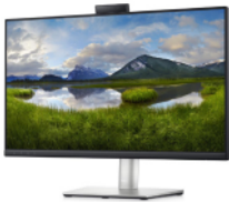
Dell 24 Video Conferencing Monitor - C2423H

Stay in sync on a 24-inch FHD monitor with built-in conferencing essentials, low blue light and an eco-friendly design.