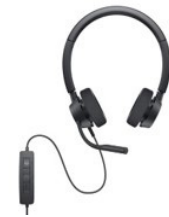
Dell Wired/Wireless Headset - WH3022

Work efficiently. Easy dual-mode connectivity offers you the option to pair and connect to almost any PC via 2.4GHz wireless or Bluetooth 5.0.