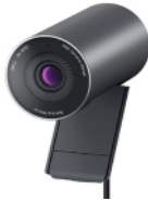
Dell Pro Webcam - WB5023

Stay productive, no matter where you work. Reduce harmful blue light with this sleek 23.8-inch FHD hub monitor with ComfortView Plus.