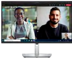
Dell 27 Monitor - P2723D

Create your ideal workspace with these recommended accessories.