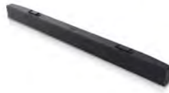
Dell Slim Soundbar - SB521A

Stay focused on a 27-inch QHD monitor optimized to deliver high performance details and clarity.