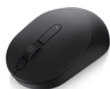
Dell Mobile Wireless Mouse - MS3320W

Collaborate confidently with this 2K QHD webcam that's essential for everyday use.