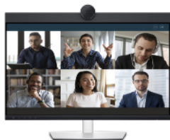
Dell 24 Video Conferencing Monitor - P2424HEB

Experience clear communication with this wireless AI-based noise cancellation headset, designed with a focus on productivity and comfort for all day conferencing.