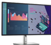
Dell 27 Monitor - P2725H

As the world's #1 monitor company 1 , Dell knows that the modern workplace requires more than PCs. We offer 200+ branded accessories to keep you connected and collaborative no matter your work style. Dell recommended solutions are designed and tested to connect seamlessly with your PC.