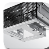
Anti-vibration drive cage