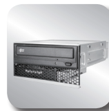
1 x 5.25" + 1 x 3.5" Removable drive bay

※ PSU ※ M/B Support ※ I/O Gasket ※ Air Duct ※ (Detailed in CHENBRO websites)