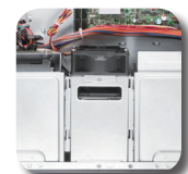
2.5" cage with 80mm fan