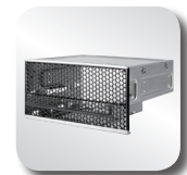
1 x 5.25" + 1 x slim ODD Removable drive bay