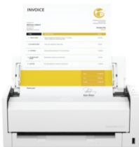
HP ScanJet Pro 4200 s1